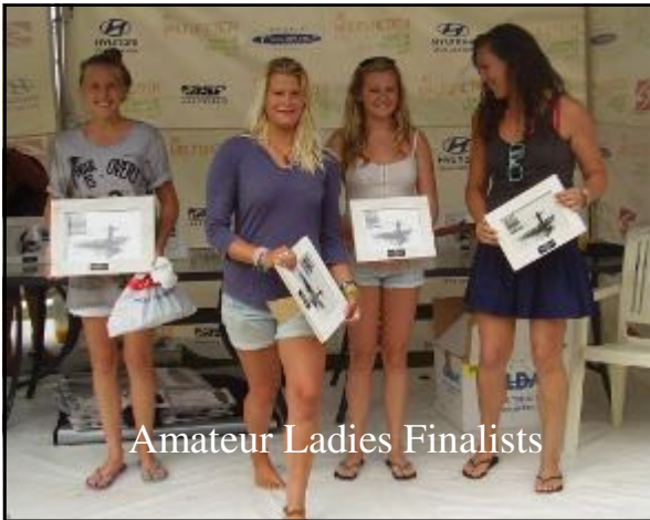
Amateur Ladies Finalists